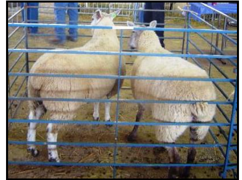
Champion Mule & 1st place Mule w/ Terminal sired lamb Clun Mule w/ Texel sired lamb