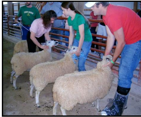
Shetland Mule lineup