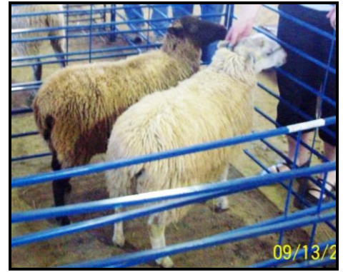
Champion Dam w/ Mule Shetland ewe w/ Mule daughter