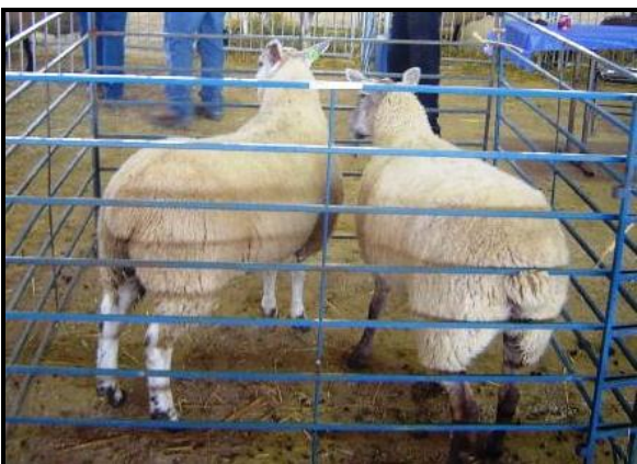
Clun Mule ewe (on right) w/ Texel sired grass fed lamb

In the afternoon I gave a short presentation on the finer points of the breed which was well attended and great interest was shown in the discussion. We finished the day with an evening meal with our hosts.