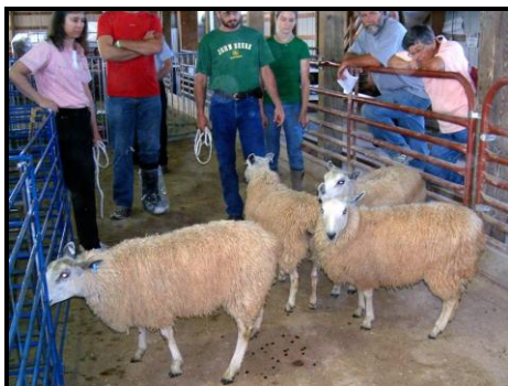
Shetland Mule entries

The NAMSS would like to acknowledge the following sponsors for their generous of support of the: