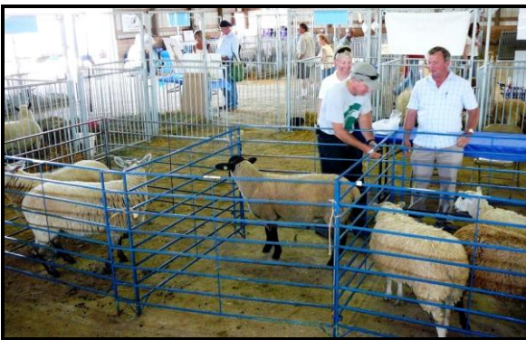
Display of the Stratified Breeding System

We were collected from Milwaukee Airport by Shelly an organizer of the show who kindly took the time to drive us around the city of Milwaukee on the edge of Lake Michigan before delivering us to our hotel in Jefferson.