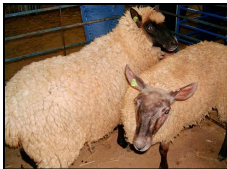
Clun Forest ewe w/ Mule daughter