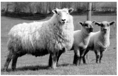
Exmoor Mule ewe