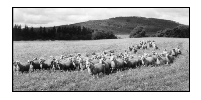
Scotch Mule ewe lambs