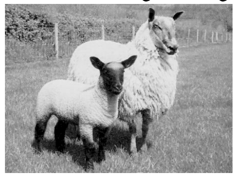
Clun Mule ewe w/ Suffolk x lamb

MULES! The Premier Easy Care Commercial Ewe Prolific, Hardy, Milky