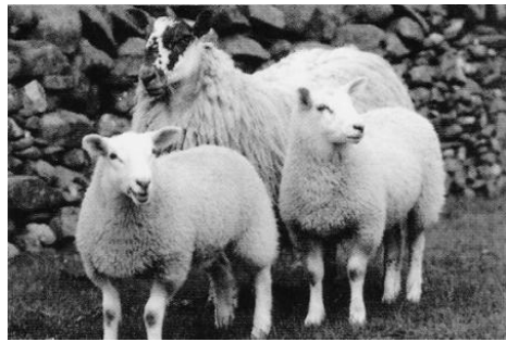
Scotch Mule ewe w/ Texel x lambs