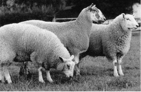
Welsh Mule ewe w/ Texel x lambs