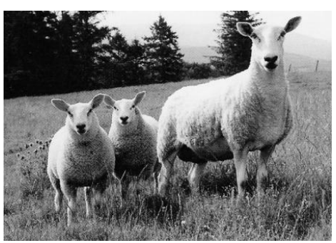
NCC Mule ewe w/ Texel x lambs