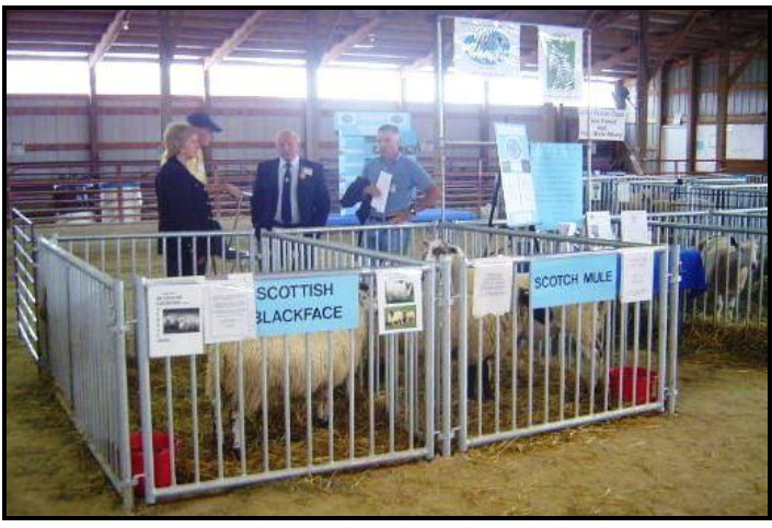
NAMSS Three-Tier sheep breed displays