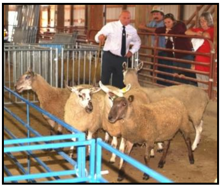
Judging Mule Ewes