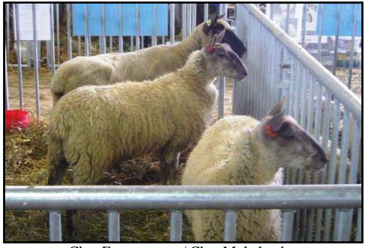
Clun Forest ewe w/ Clun Mule lambs

The North American Mule Sheep Society held is 1st annual "Mule Sheep and Bluefaced Leicester Progeny Show" on September 7th, 2008 in conjunction with the Wisconsin Sheep & Wool Festival in Jefferson, Wisconsin.