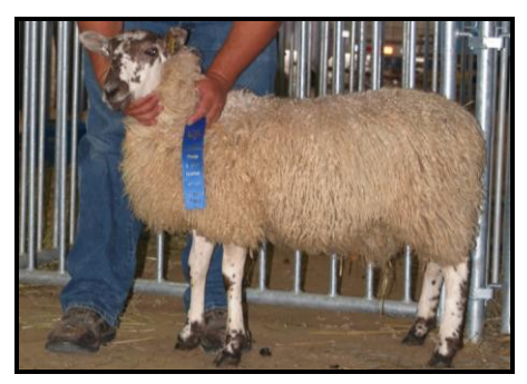
1st prize & Champion Mule Littledale