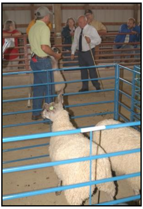
Judging Mule Progeny Groups