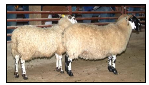
CH Hill Dam w/ Mule Progeny Littledale

Champion Progeny Group- Muleflock, MI Res. CH Progeny Group- Littledale, WI